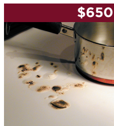
$650 Countertop burned during cooking accident